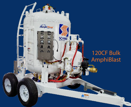
120CF Bulk AmphiBlast