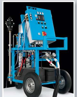
WIWA PU 460 polyurea systems