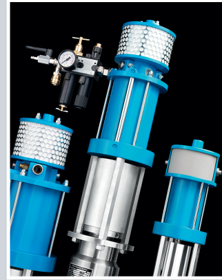
WIWA material feed pumps for almost every application field