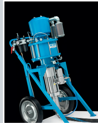
WIWA airless, air combi and hot spray systems