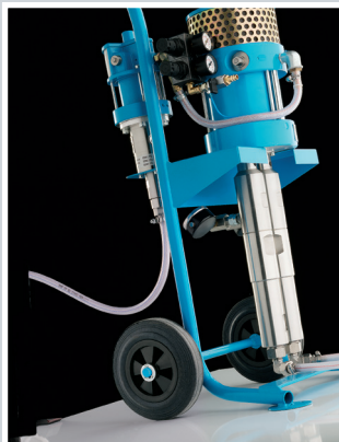
WIWA DUOMIX 2K airless paint spraying systems