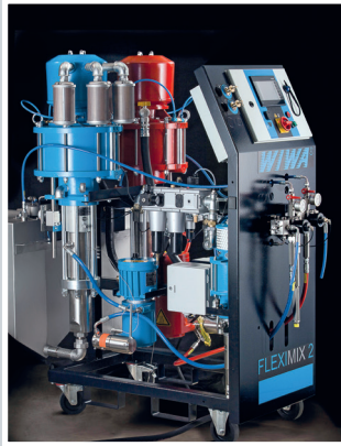
WIWA FLEXIMIX, electronic 2K painting and coating systems