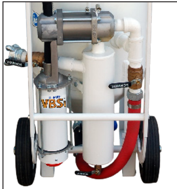
VBSII on the back of a Schmidt Abrasive Blaster

+603-7865-6524 SCHMIDTABRASIVEBLASTING.COM